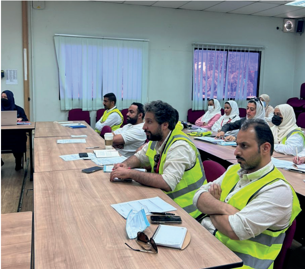
Briefing Prior Mock Inspection at the Authorized Facility