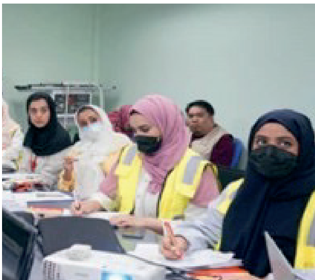
Mock Inspection Interviews at the Actual Authorized facility

As part of the program, participants engage in mock inspection scenarios and actual sampling procedures at authorized facilities, further solidifying their practical experience and readiness to perform their roles effectively.