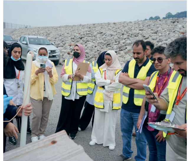
Briefing Prior Sampling as part of Inspection at the Authorized Facility

The program is comprehensive, encompassing legal, technical, and practical instruction to provide assessors and inspectors with the necessary knowledge, skills, and attitudes to meet their regulatory responsibilities. To ensure proficiency, each participant is required to progress through three levels of formal training—beginner, intermediate, and advanced—and also to engage in hands-on learning, which includes site visits, workshops, case studies, and exchanges with other regulatory authorities. Only upon fulfilling all these requirements is an assessor or inspector authorized to undertake their regulatory responsibilities.