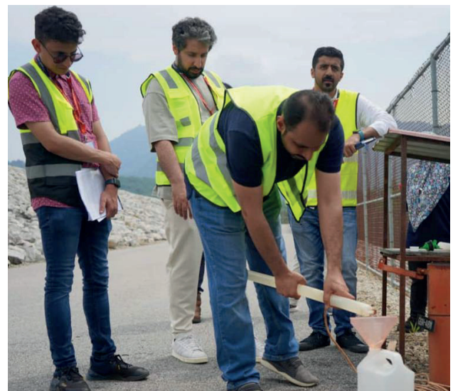
Sampling for Inspection